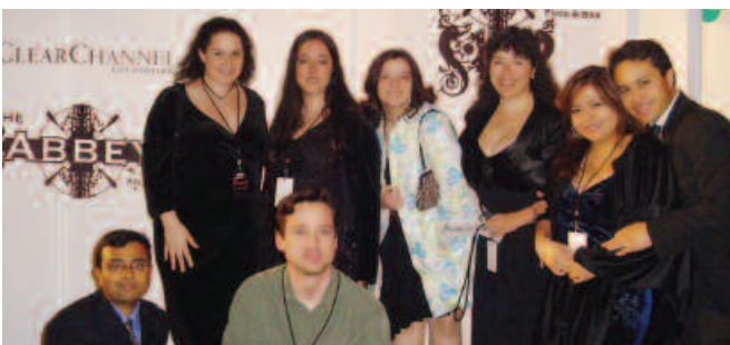
OSCAR NIGHT BENEFIT • MARCH 5, 2006