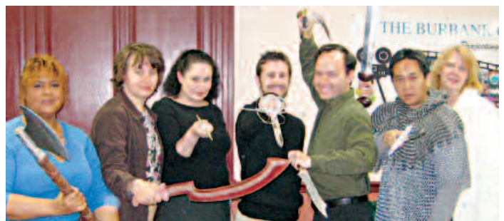
SWORDBLAY, JAYCEE NIGHT • MARCH 16, 2006